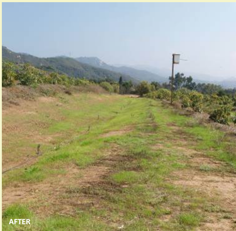
Diversion installed across the slope to safely carry stormwater to a stable outlet