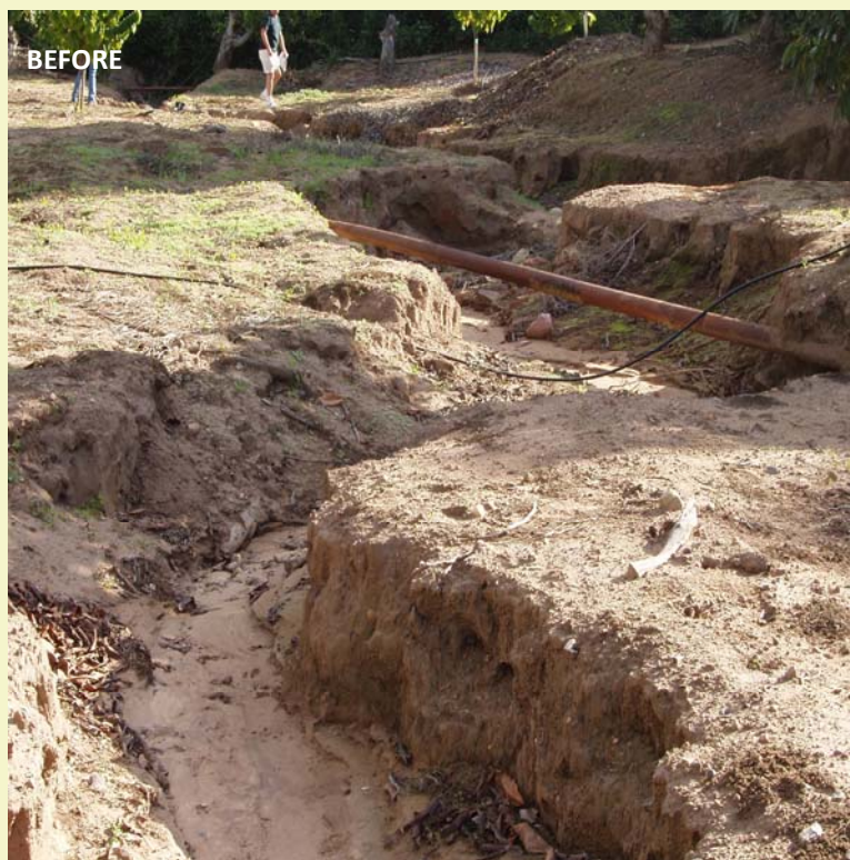
Gully erosion in orchard caused by concentrated flow from stormwater runoff